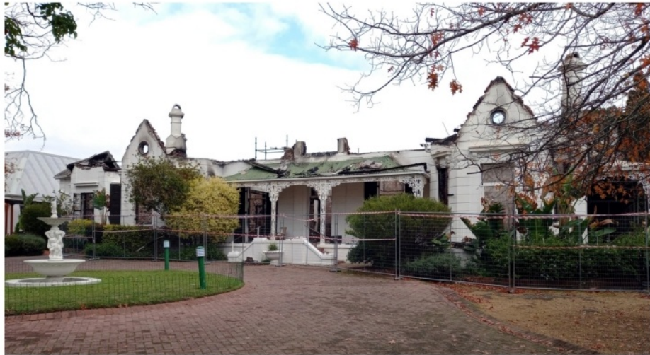
After the fire on 1 May 2023

In the early hours of 1 May a passing Princeton patrol spotted a fire at Sherwood House in Sherwood Road. The fire quickly engulfed the old building, forcing evacuation of all residents who were put up by kind neighbours across the road until they could be accommodated safely for the next few days.