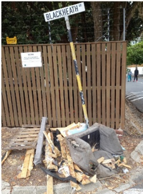
Illegal dumping, November 2023