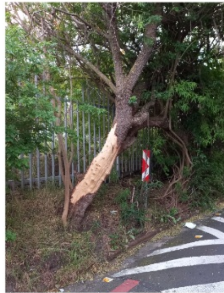
This tree at the top of Bathurst Rd had its bark stripped in October. Hopefully the tree will recover.

Trees blocking your street? Missing drain covers? Illegal dumping? Burst water mains? Street lights out?