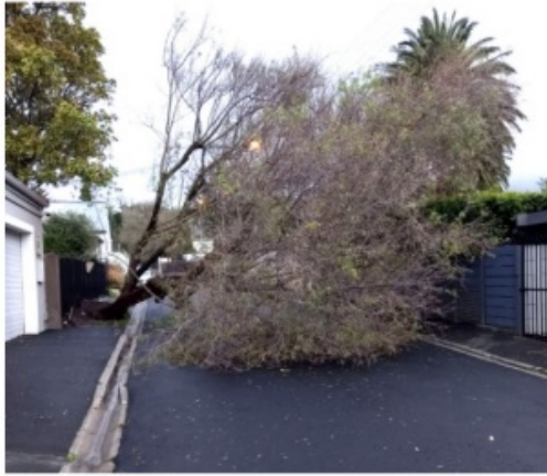
Storm damage in Bray Rd, August 2023