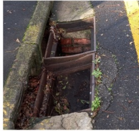
Drain covers AWOL. Bathurst Road