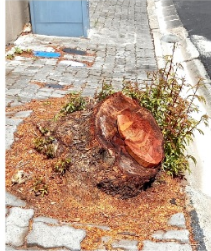
23 November 2023

Sawdust and a stump -- all that remained of a pavement tree in Bray Road after it was cut down in mid-October. Planted by the council about 20 years ago, the tree was overhanging the road and had become a problem for large vehicles, particularly the weekly rubbish truck.