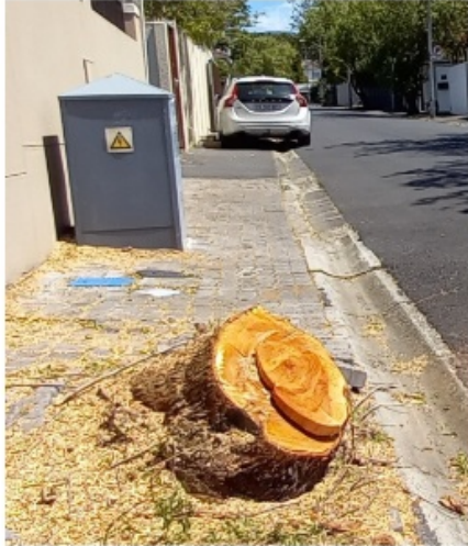
14 October 2023