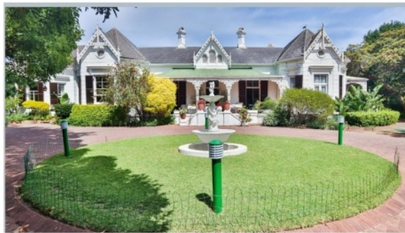
Historic Sherwood House before the fire

In the early hours of 1 May a passing Princeton patrol spotted a fire at Sherwood House in Sherwood Road. The fire quickly engulfed the old building, forcing evacuation of all residents who were put up by kind neighbours across the road until they could be accommodated safely for the next few days.